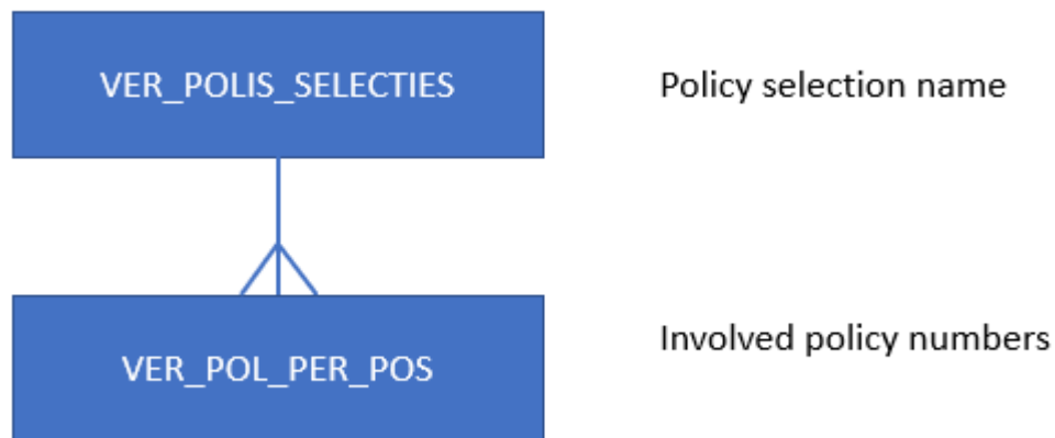
Figure 3.2: Policy selection tables.

It might be more convenient to use a SQL tool, such as SQL*Plus, to create the necessary rows manually in these tables.