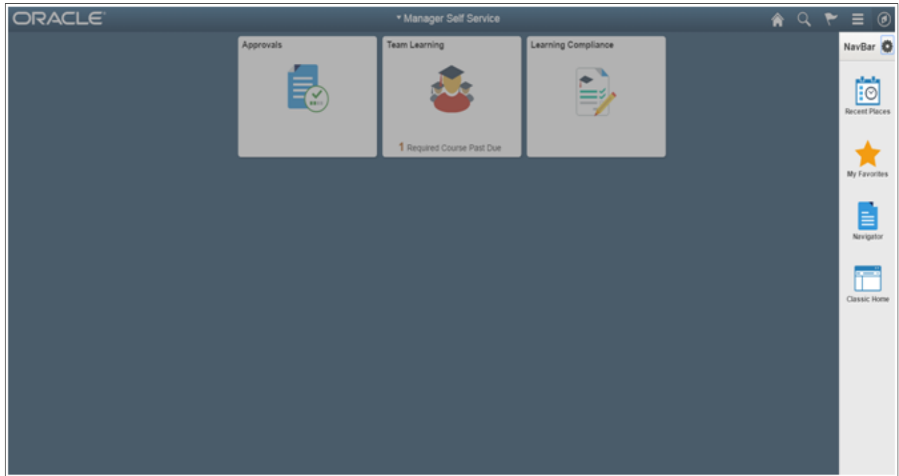
NavBar side page