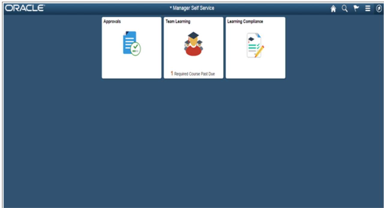
PeopleSoft Fluid User Interface home page

The Navigation bar (NavBar) side page appears.