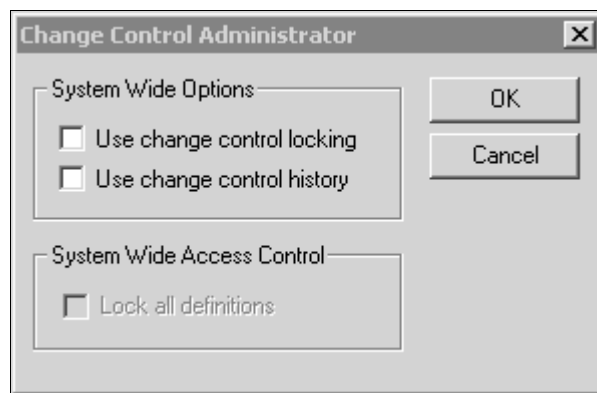
Change Control Administrator dialog box

The following example shows the options available on the Change Control Administrator dialog box: