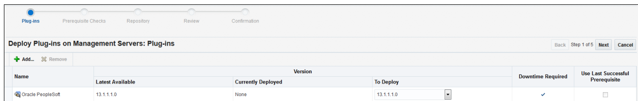
Deploy Plug-ins on Management Server: Plug-ins window

The Deploy Plug-ins on Management Servers window appears.