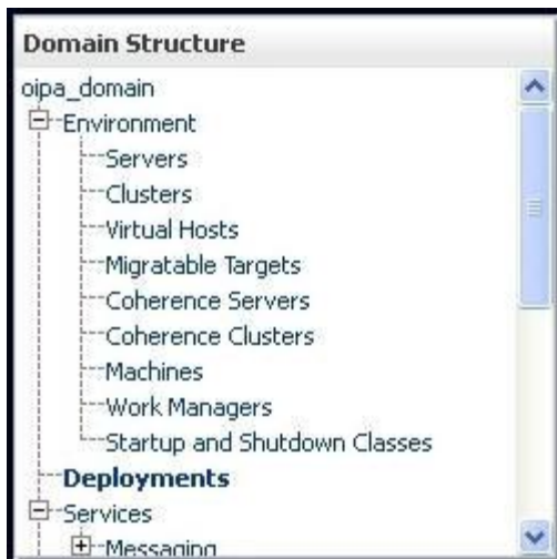
Deployments node within the WebLogic Domain Structure

To check cycle, ensure that run.sh (located in the /usr/oipa/OIPA_Home/CycleClient/bin/ folder) executes successfully from the cycle client.