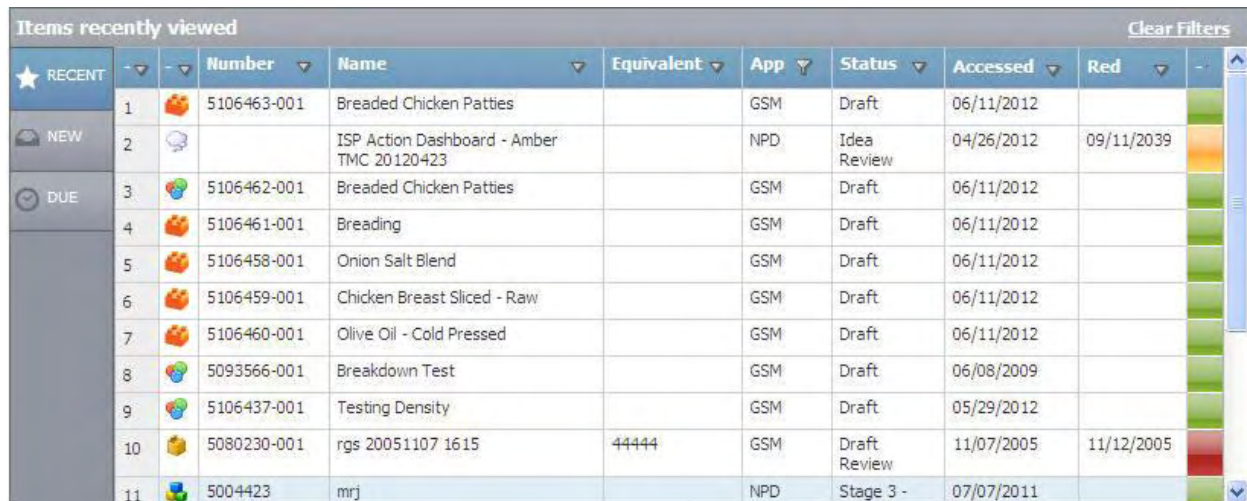
Figure 4. App Column with filter

When there are one or more filters selected on the grid, the Clear Filters link appears. Click Clear Filters to remove all filters from that grid.