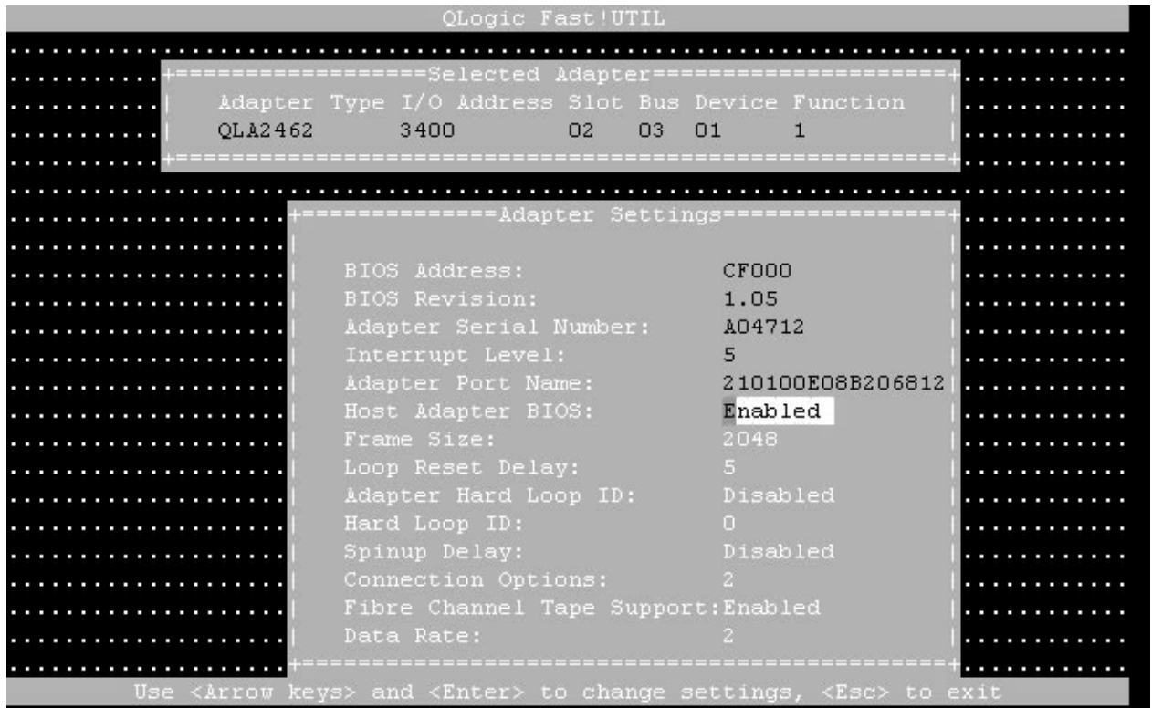
FIGURE 7-2 luxadm display Command and Output

Unformatted capacity: 10240.000 MBytes Read Cache: Enabled Minimum prefetch: 0x0 Maximum prefetch: 0xffff Device Type: Disk device Path(s): /dev/rdisk/c0t600015D0002028000000000000001142d0s2 /devices/scsi_vhci/disk@g600015d0002028000000000000001142:c,raw Controller /dev/cfg/c4 Device Address 213600015d207200,0 Host controller port WWN 210100e08b206812 Class primary State ONLINE Controller /dev/cfg/c11 Device Address 213600015d207200,0 Host controller port WWN 210100e08b30a2f2 Class primary State ONLINE