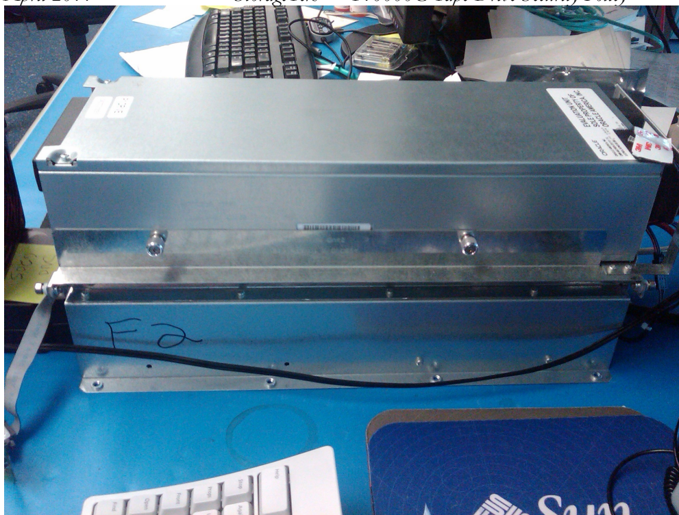
Figure 1.6: Left side of T10000C