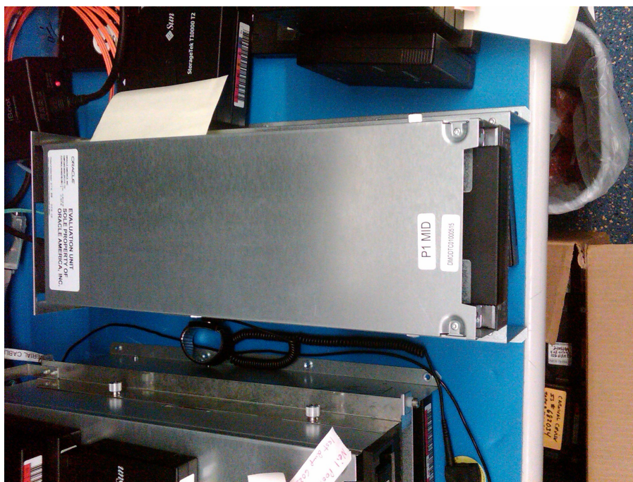
Figure 1.3: Top of T10000C