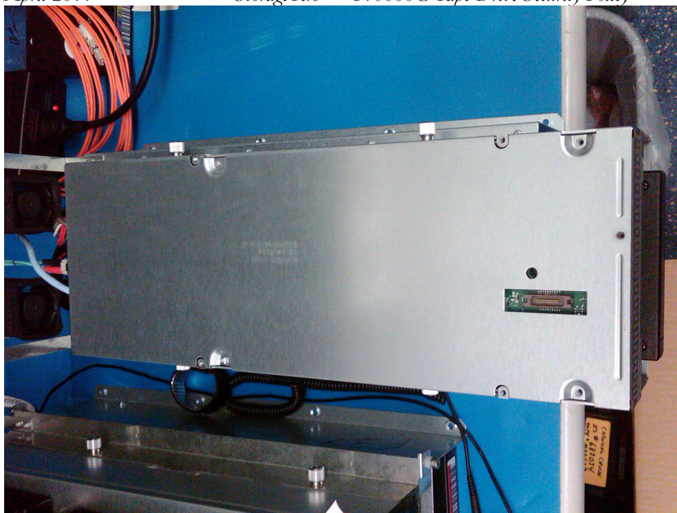
Figure 1.2: Bottom of T10000C