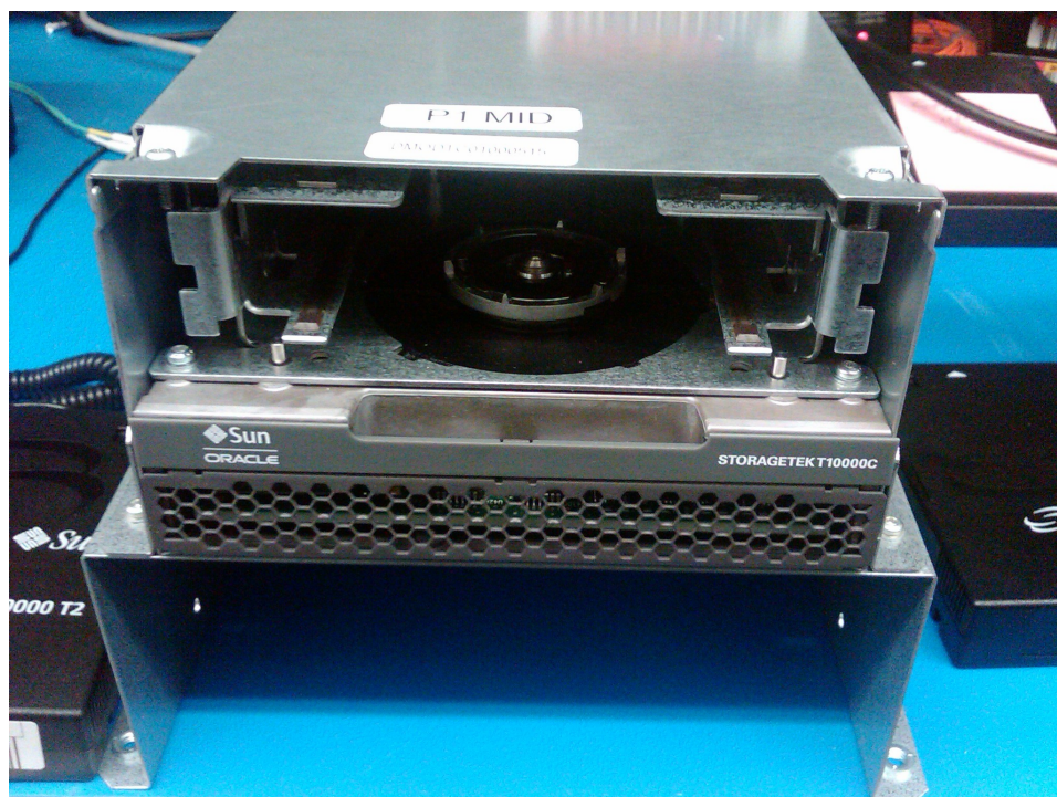
Figure 1.1: Front of T10000C

The cryptographic boundary of the ETD is the external surface of the tape drive’s commercial-grade metallic enclosure. Figures 1.1 – 1.6 illustrate the cryptographic boundary as defined. Note: Figure 1.2 appears to be upside-down to show bottom plate.