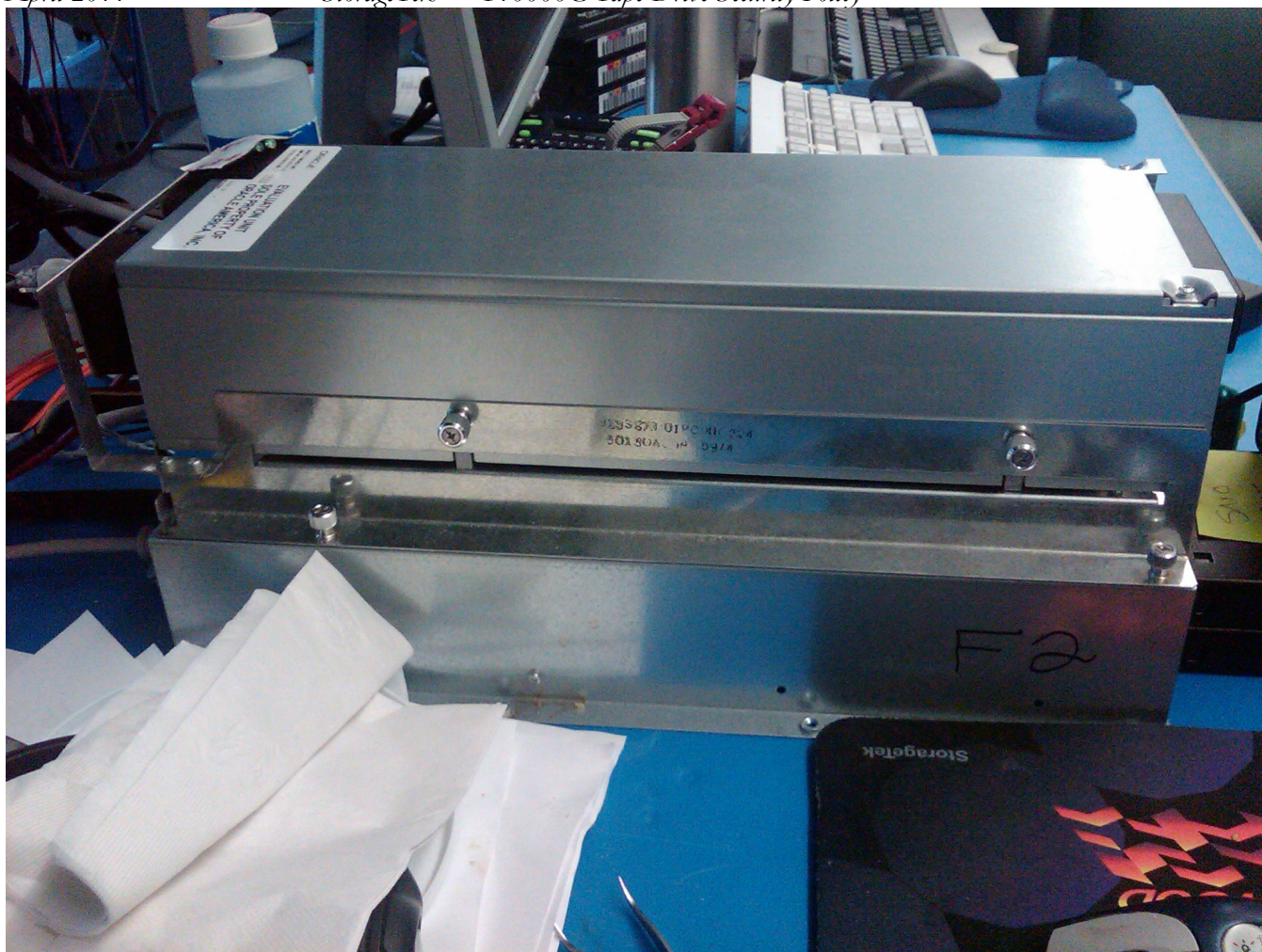
Figure 1.5: Right side of T10000C