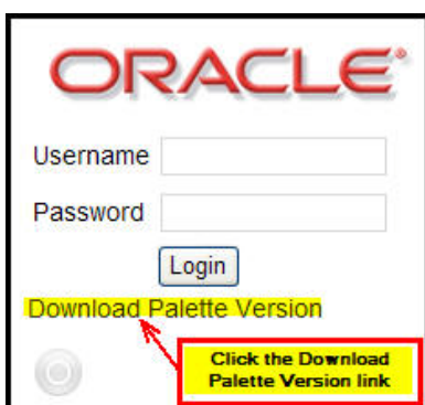
Web Application Utility Download link

Note: You do not need to enter a user name and password.