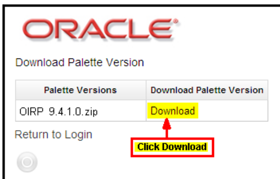
Web Application Utility Download list