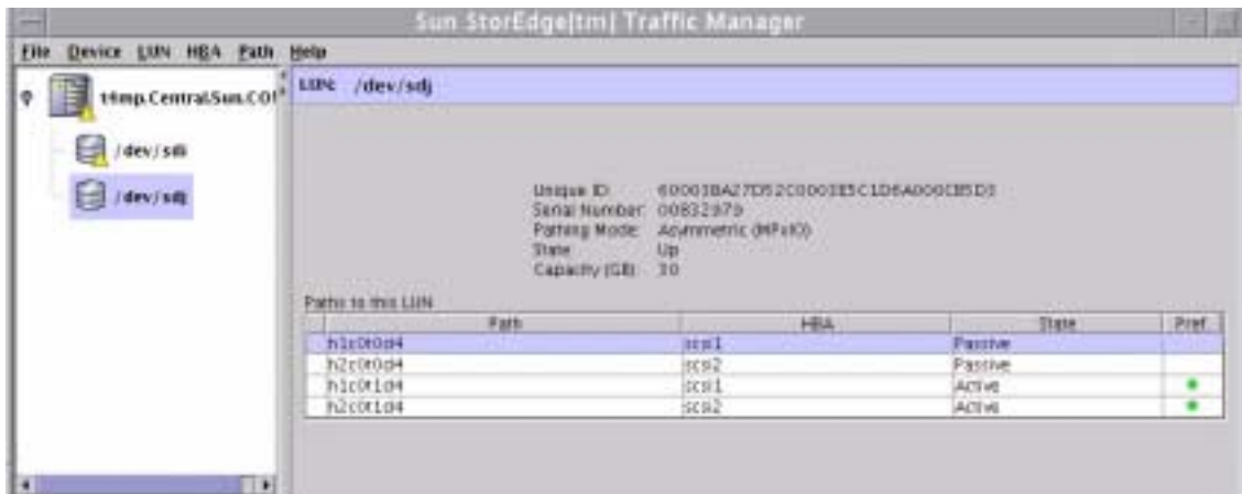
FIGURE 1-1 Host Data Paths Between HBAs and the Storage Devices

In FIGURE 1-1, each storage device and the LUNs associated with it are shown on the left side of the screen and the paths and host bus adapter (HBA) system names are shown on the right.