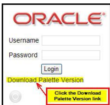
Web Application Utility Download link

Note: You do not need to enter a user name and password.