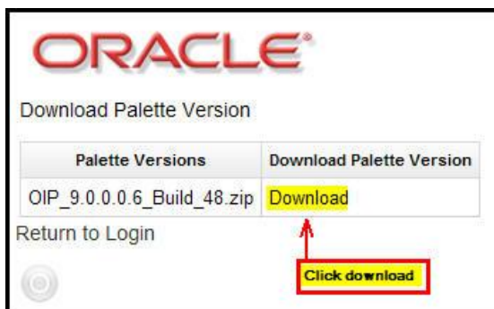
Web Application Utility Download list