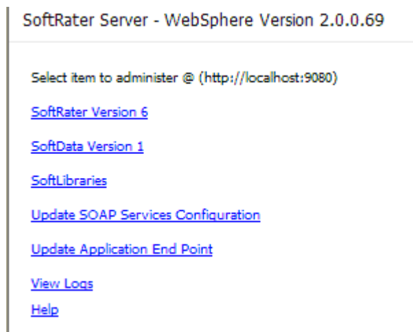
Figure 20 SoftRater Server Web

At the first screen of the Insbridge SoftRater Server the following will be displayed: