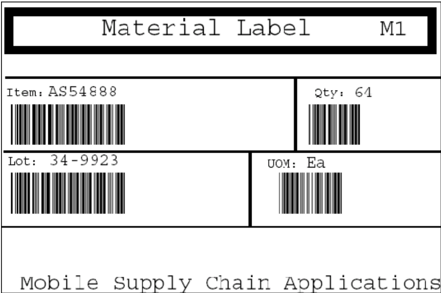
Figure 4–1 Material Label

See Also: Windows and Navigator Paths Oracle Mobile Supply Chain Applications User's Guide